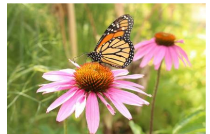
Narrow Leaved Cone Flower