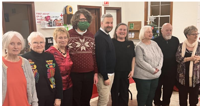
*Winona Horticultural Society Board of Directors*