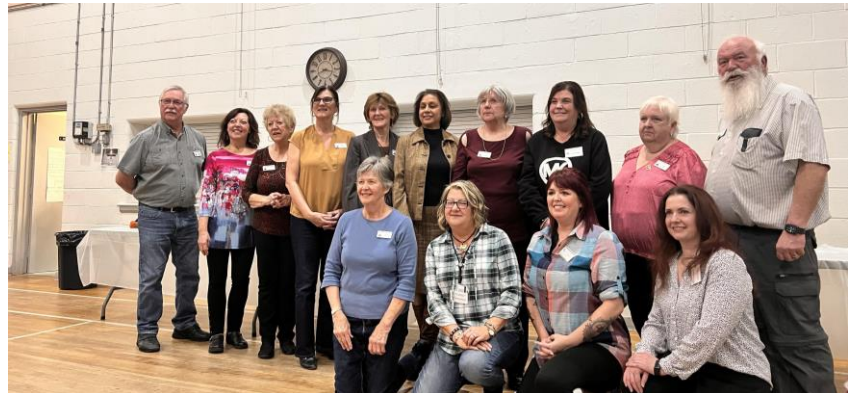
*Stoney Creek Horticultural Society Board of Directors*