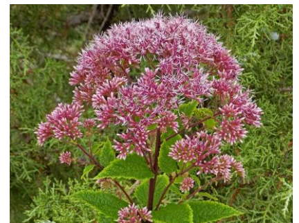
Sweet Joe Pye Weed