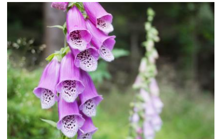
Common Fox Glove