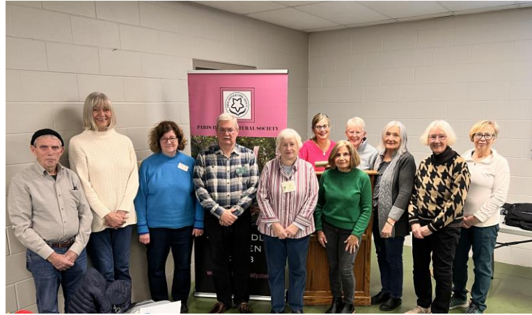
*Paris Horticultural Society Board*