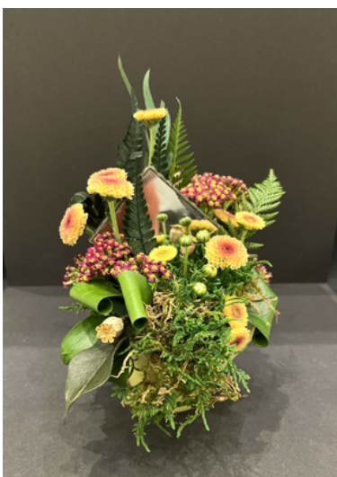
Judges Choice Lil