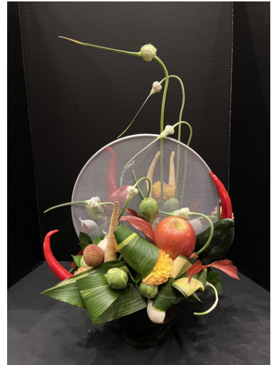
Best in Show Lil