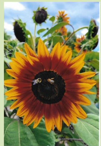
Class E- Garden Images 1st- Karen Mattan