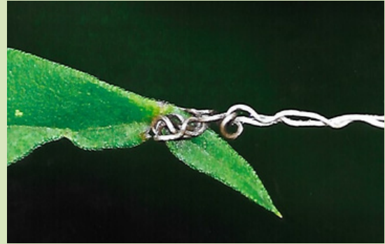
Class B- Flowers or Foliage 1st- James Tovey Best in Show