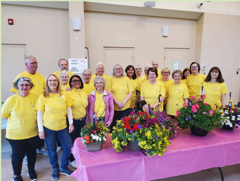
Some of our 30 + members who volunteered at the sale.