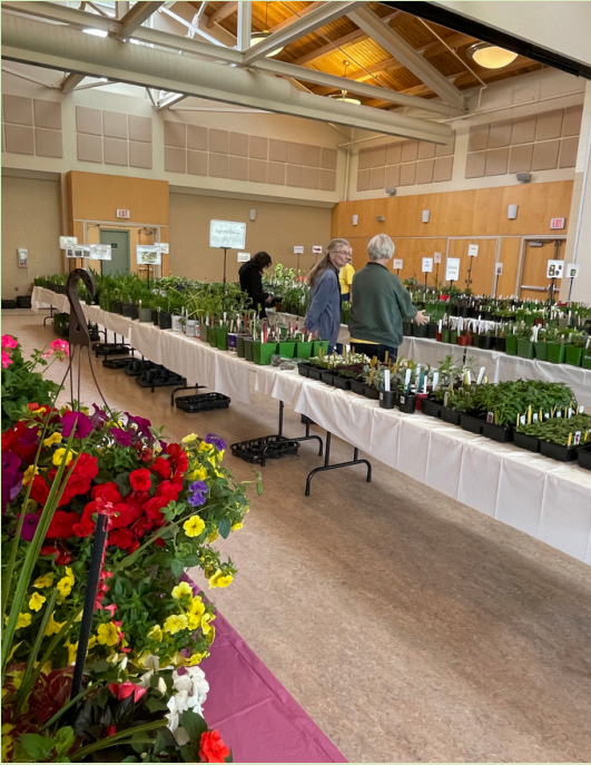
All set up and ready to go.