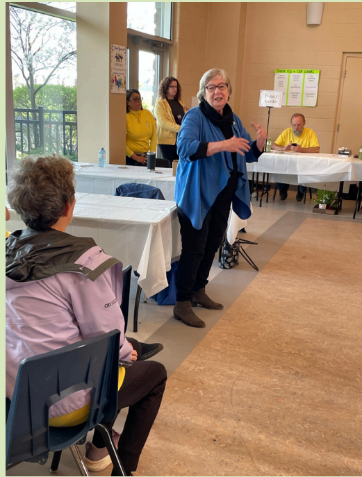
Mayor Lawlor dropped by to thank the GHS for 106 years of volunteering in promoting gardening and public beautification.